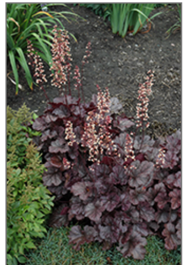
Grape Expectations Coral Bells in bloom