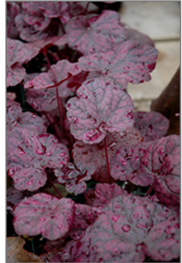
Grape Expectations Coral Bells foliage

Grape Expectations Coral Bells is recommended for the following landscape applications;