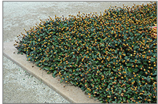
Peek A Boo Para Cress in bloom