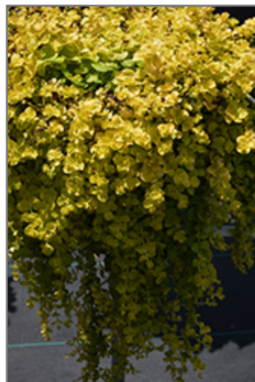
Golden Creeping Jenny foliage

Golden Creeping Jenny is a fine choice for the garden, but it is also a good selection for planting in outdoor containers and hanging baskets. Because of its spreading habit of growth, it is ideally suited for use as a 'spiller' in the 'spiller-thriller-filler' container combination; plant it near the edges where it can spill gracefully over the pot. Note that when growing plants in outdoor containers and baskets, they may require more frequent waterings than they would in the yard or garden.