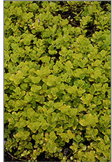
Golden Creeping Jenny foliage

Golden Creeping Jenny is recommended for the following landscape applications;