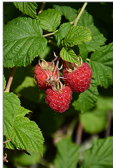
Raspberry Shortcake Raspberry fruit

Raspberry Shortcake Raspberry has rich green deciduous foliage on a plant with an upright spreading habit of growth. The textured oval compound leaves do not develop any appreciable fall color. It features an abundance of magnificent red berries in mid summer.