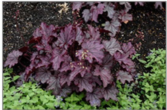
Spellbound Coral Bells