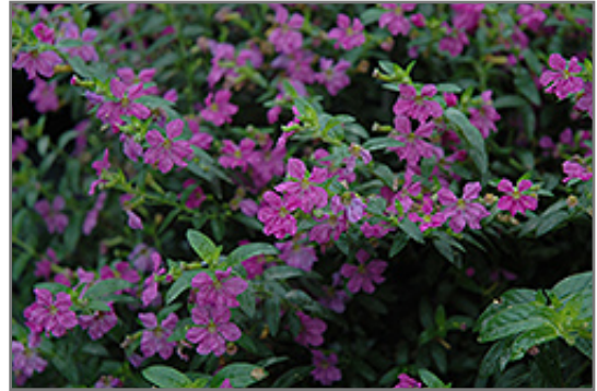
Allyson Mexican Heather flowers