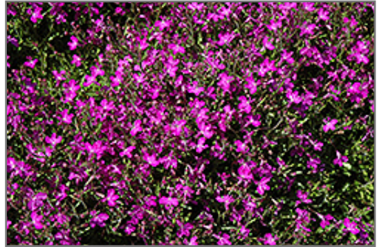
Techno Violet Lobelia flowers

Techno Violet Lobelia is a fine choice for the garden, but it is also a good selection for planting in hanging baskets. Because of its trailing habit of growth, it is ideally suited for use as a 'spiller' in the 'spiller-thriller-filler' container combination; plant it near the edges where it can spill gracefully over the pot. Note that when growing plants in outdoor containers and baskets, they may require more frequent waterings than they would in the yard or garden.