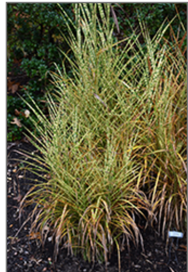
Gold Breeze Maiden Grass